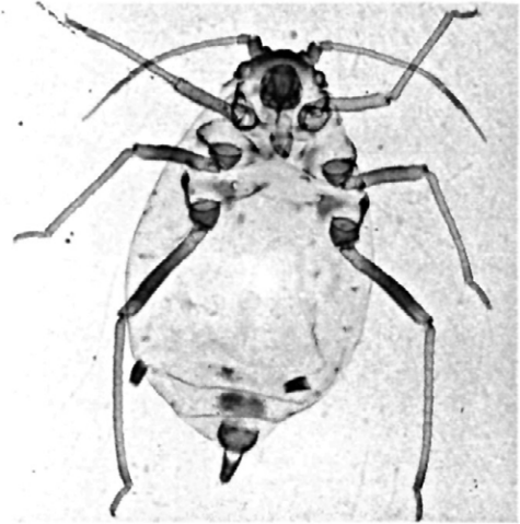
Figura 7: Melanaphis donacis , apterous form (x 26.5).

Macrosiphoniella tanacetaria bonariensis E.E. Blanchard, 1922