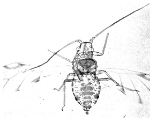
Figura 2: Saltusaphis scirpus , alate form (x 17).