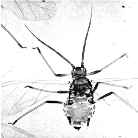
Figura 4: Brachycaudus persicae , alate form (x 16).