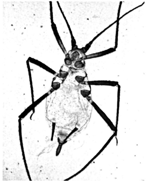
Figura 5: Macrosiphoniella tanacetaria bonariensis , apterous form (x 17).

The name Macrosiphoniella tanacetaria italica Hille Ris Lambers, 1967 was recently confirmed as a synonym of Macro-