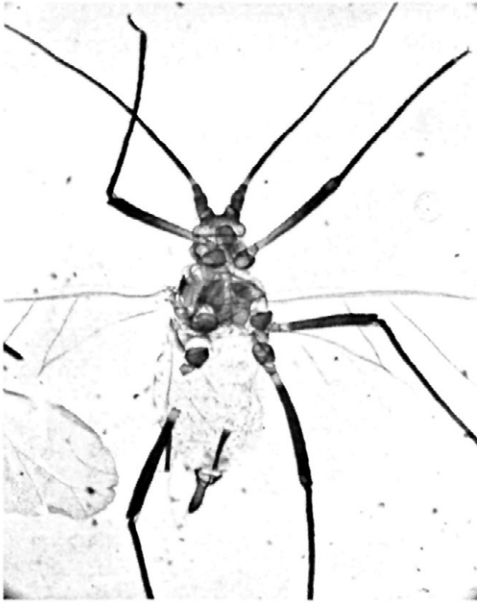
Figura 6: Macrosiphoniella tanacetaria bonariensis , alate form (x 15).