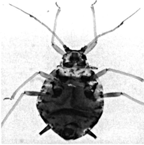
Figura 3: Brachycaudus persicae , apterous form (x 15).