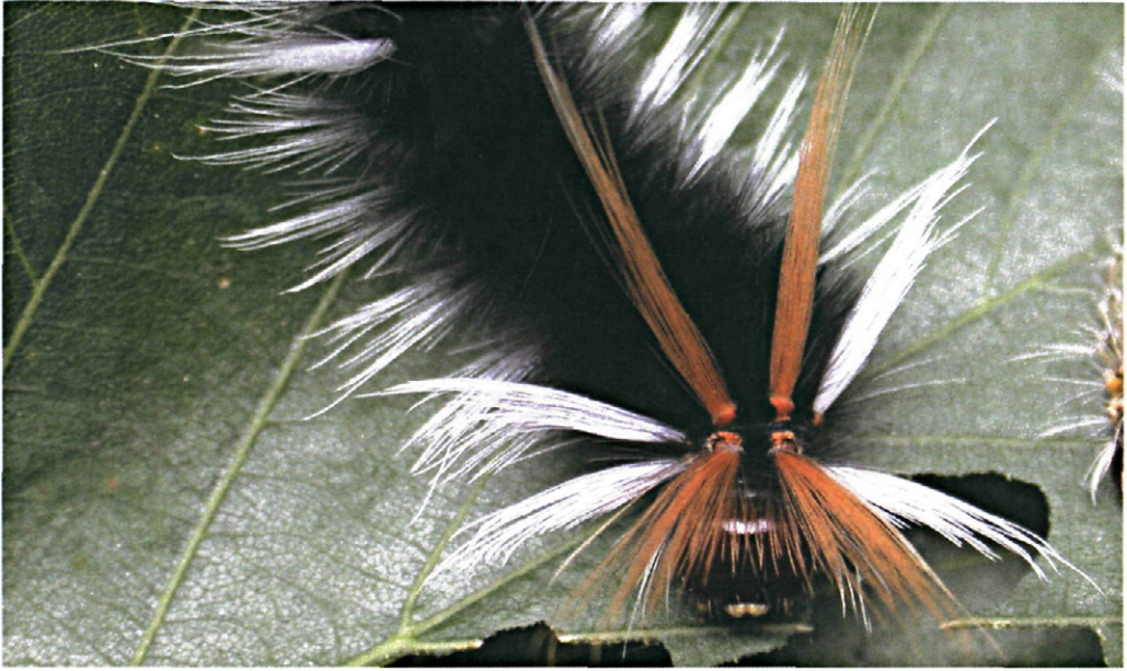
Fig. 3: Mature larva of H. ruscheweyhi

Females go through one instar more than males; the percentage of female larvae with eight instars was 62.5%, and only 31.3% had seven instars.