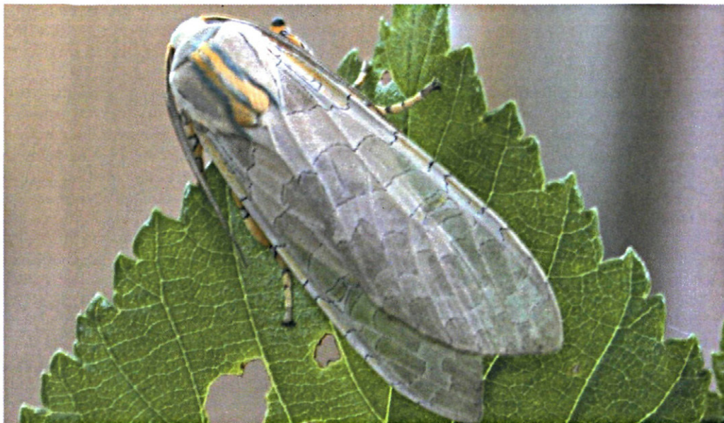
Fig. 1: Adult of H. ruscheweyhi

ber until March, on trees where the insect was present and in the ground cover in the areas of study. During the period when adults fly, pre-established sectors of the trees were carefully observed to determine the presence of egg masses. Nine unhatched egg masses were marked and were monitored daily until the larvae dispersed. The periodic collection of larvae made it possible to follow the evolution of the populations and the period in which the larvae pupated. The age of the larvae population was calculated through measurement of the width of the cephalic capsule, although in the last few instars this could not be determined with absolute precision, as will be commented on below. The period when adults fly was estimated from direct observation, from captures in light traps, and from specimens reared in the laboratory.